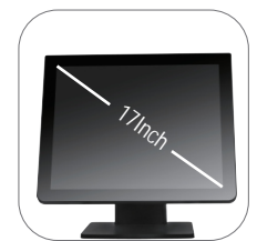
17 inch display