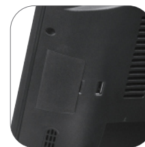
Port for MSR