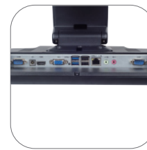
Multiple I/O interface