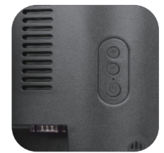
OSD control button