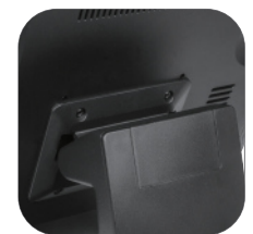
VESA 75*75mm or 100*100mm